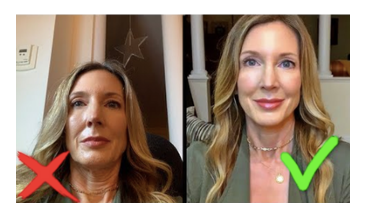
(Bad angle vs. Good angle)