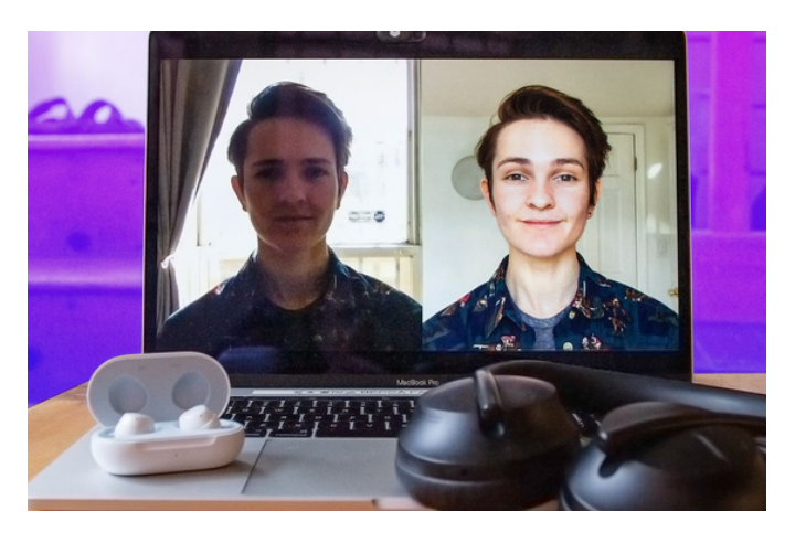
(Bad lighting vs. Good lighting)