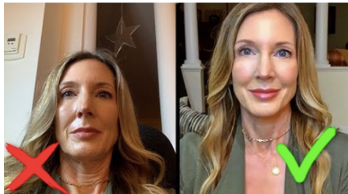
(Bad angle vs. Good angle)